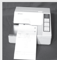
Epson Ticket Printer