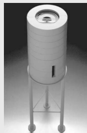
CRC-PS Positron Shield