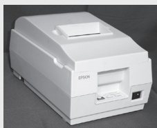
Epson Roll Printer