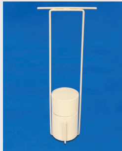
Molly Assay Canister