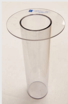
Chamber Well Insert