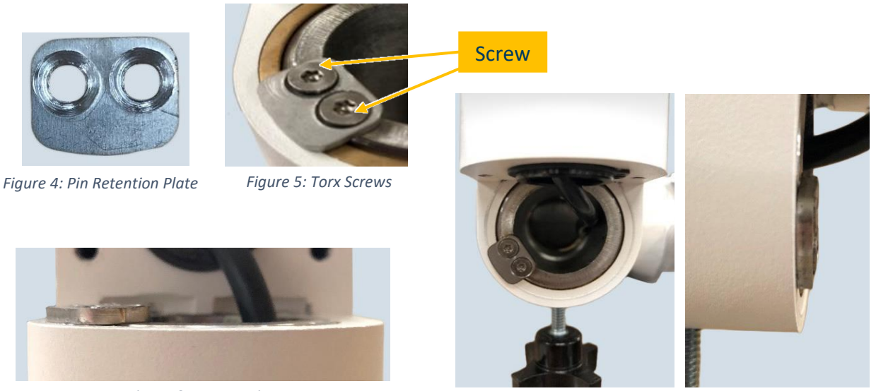
Figure 6: Bottom View