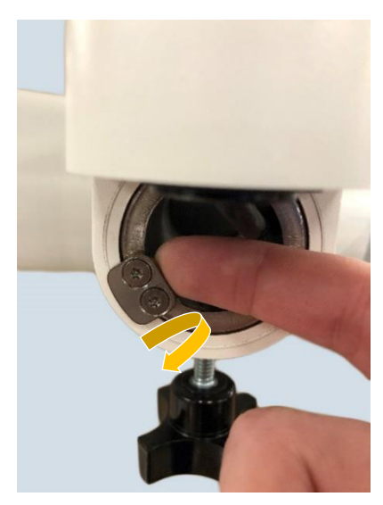
Figure 11: Hand Support Positioning