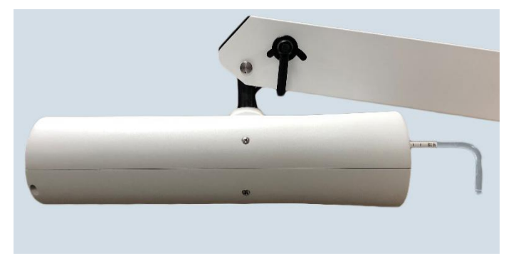
Figure 2: Collimator Positioning

1. Turn the Collimator to the horizontal position as indicated in figure 1.