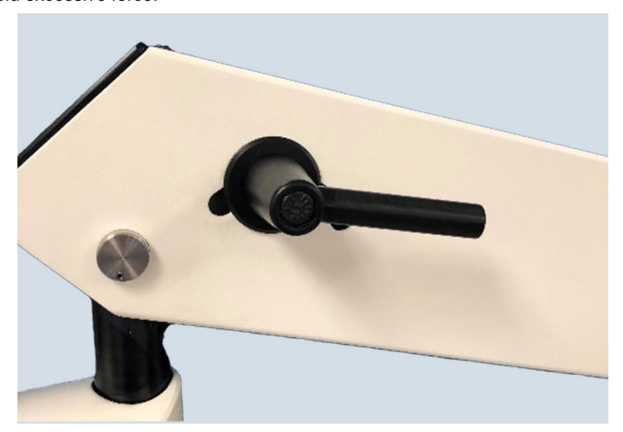
Figure 1: Spring Arm Locking Handle