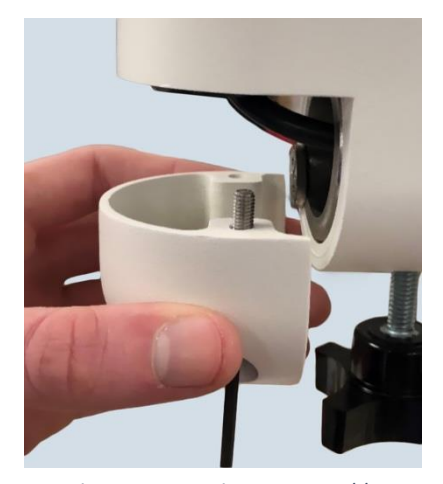
Figure 14: Housing Re-Assembly

If this inspection shows that the collimator is properly attached as shown in figures 6, 7, and 8 then your Captus 4000e System can continue to be operated. However, please be cautious when moving the collimator. Please refrain from quickly spinning the collimator or using strong pulling forces on it. The plate is still at risk from failing if the collimator is used too aggressively.