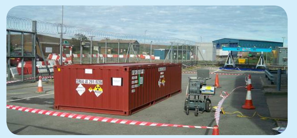
Onsite measurements were conducted between 2009 and 2012.

LLWR Ltd's key requirement is to verify that ISO containers meet the consignor's declared information. LLWR Ltd is developing the range of its services offered to clients. Its underlying objective is to ensure that waste is sentenced to the LLWR repository appropriately and to maximize utilization of the available space for storage of consignments.