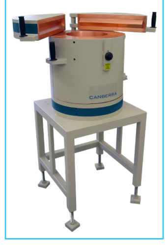
Top doors are linked – so they open and close together