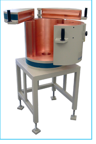
Front door provides full-area access