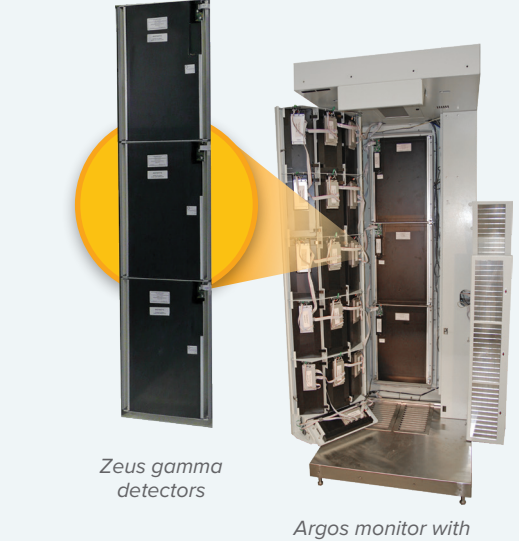
Argos monitor with Zeus option