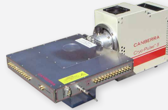
13X-13Y strip detector for tracking with electrical cooler Cryo-Pulse® 5 cryostat