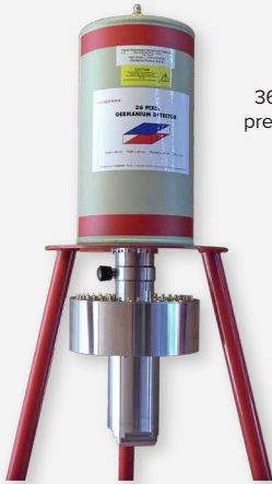
36 pixel for gamma applications (BNCT, precise neutron section measurements to better understand (n,xn) reactions)