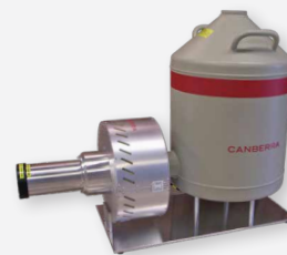
64 pixel detector in a horizontal cryostat design