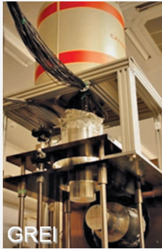
Two Telescopes with each two DSSDs –for the “GREI” project