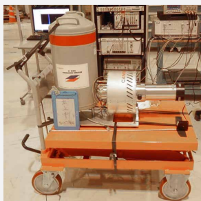
25 pixel for EXAFS at Spring8