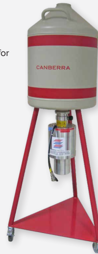
Telescope of two DSSD for Compton camera