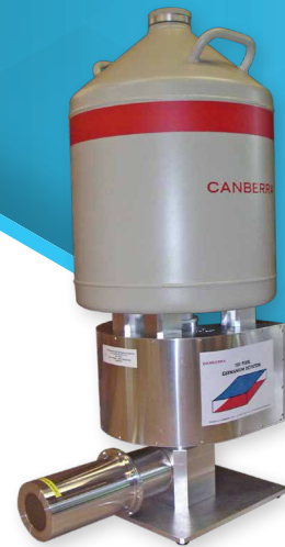
100 pixel detector in a vertical cryostat design

EGPS series is the best choice for X or gamma ray measurements in many applications such as Physics or Astrophysics experiments.