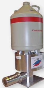
100 pixel detector in a vertical cryostat design