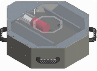
Guard detector assembly showing the plastic scintillator, PMT and Osprey MCA.

The heart of the guard detector, which is an optimally designed plastic scintillator detector with photomultiplier tube, is the Mirion Osprey<sup>®</sup> Digital MCA Tube Base. The Osprey unit powers the detector and provides a gate signal to the Lynx DSA whenever it sees a pulse. This simple interface, as also schematically illustrated