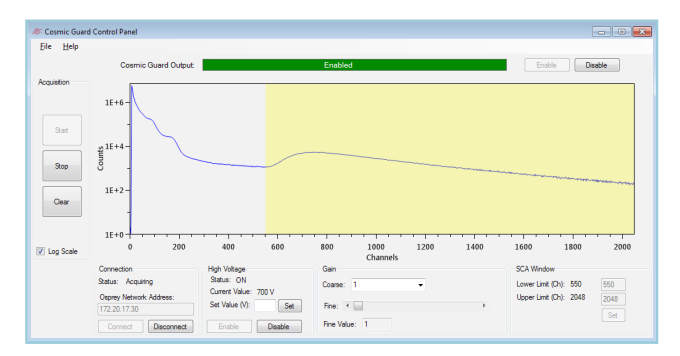
Screenshot of the CosmicGuard control application.