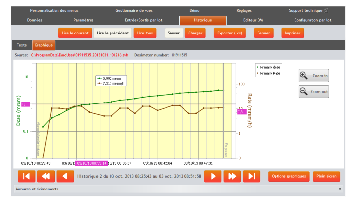
Dose measurement historical