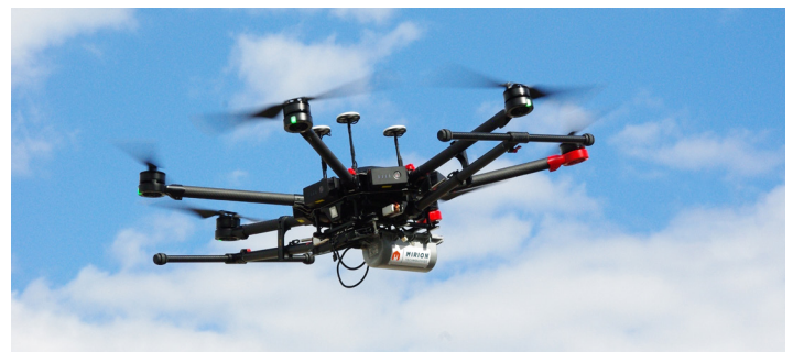
SPIR-Explorer Sensor in operation