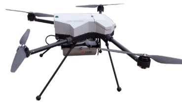
SPIR-Explorer Sensor mounted on an AERACCESS drone