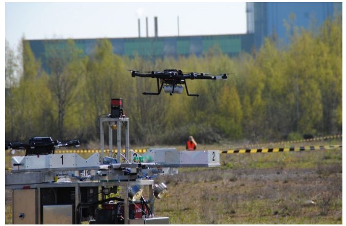
Drone landing on a platform and equipped with a SPIR-Explorer detector