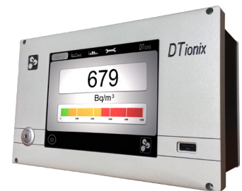
DT IONIX 3 HMI Interface

Mirion Technologies (Premium Analyse) Phone: +33 (0)3 87 51 31 75 Email: contact@premium-analyse.fr