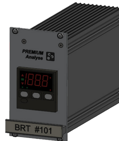
ACC BRT Thermal regulation box