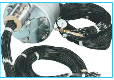
Epoxy Construction, Instrumentation