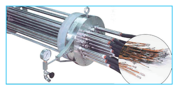
Swaged Construction, Low Voltage Instrumentation and Control with in-line butt splice connectors