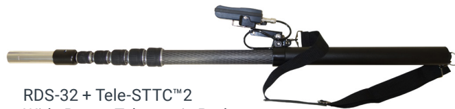
RDS-32 + Tele-STTC™2 Wide Range Telescopic Probe

*Change from GM tube to Si diode at 30 mSv/h in increasing field and back from Si diode to GM tube at 10 mSv/h in decreasing field