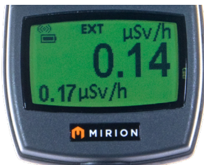
Display with Gamma Probe