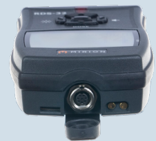
Connector, charging contacts, fixing lug for wrist strap clip