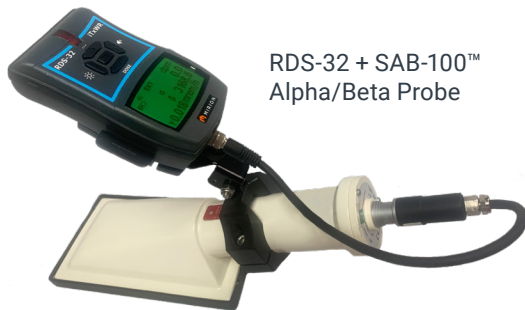
RDS-32 + SAB-100™ Alpha/Beta Probe