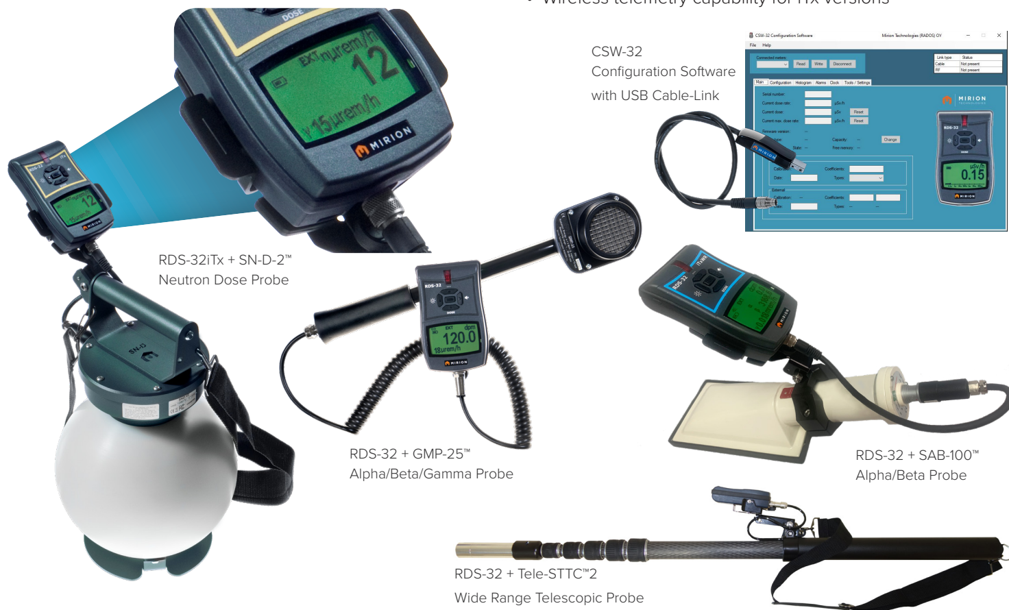
RDS-32iTx + SN-D-2™ Neutron Dose Probe