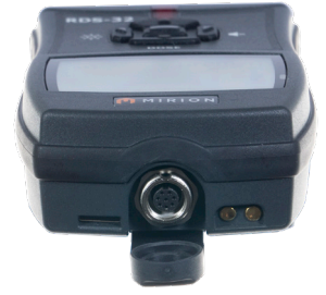
Connector, charging contacts, fixing lug for wrist strap