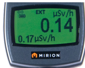
Display with Gamma Probe