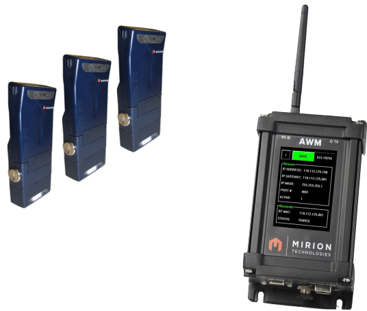
Example of a telemetry system